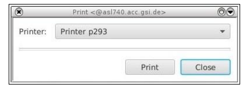
Figure 5: the Print dialog.