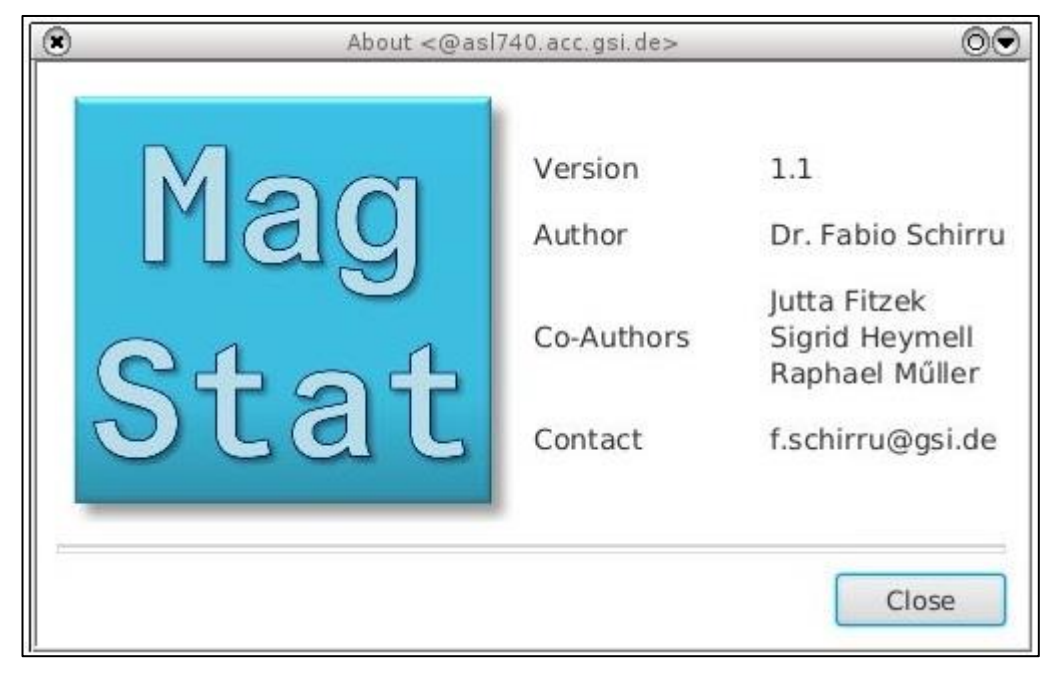
Figure 7: the About dialog.

The status bar displays messages to the user whenever a certain event occurs. It is provided of a red LED located to the right side which switches on to indicate that data are currently being saved on disk with auto saving modality (see Section 4.4.2).